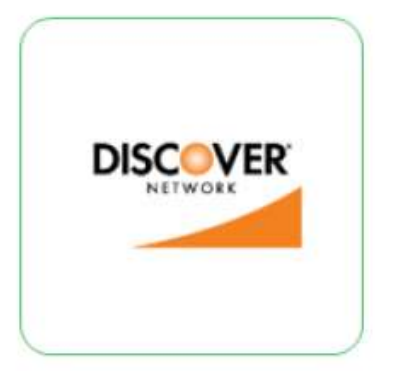
JCB/UPI/Discover Card (Through RuPay) Certified for POS/PG*