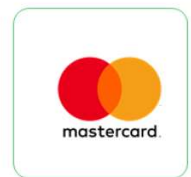
Master Card Certified for POS & PG*